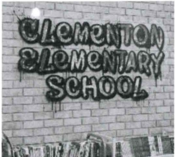
Media Center wall art

Maintaining our school building and grounds is essential to creating an engaging learning environment for students. Inside our school, several projects were completed including updates to our Media Center decor, refinishing of the floors in our gym, the kitchen and other rooms and offices. Exterior and interior walls were given a fresh coat of paint which makes any space more inviting.