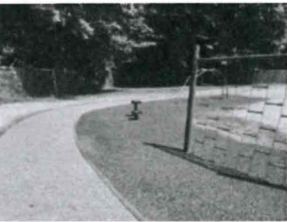
The obstacle course & walking track

This project is an excellent addition to our school grounds for students and community members to benefit from. Community members are welcome to utilize the space at the