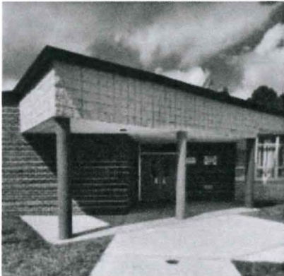
Freshly painted primary grade entrance area creates a safe color-coded entry for students and expedites police response time.

September is always a joyous time of year, especially in our school. While students and teachers were enjoying their summer vacations, contractors and the building and grounds team were hard at work on projects to refresh indoor and outdoor spaces.